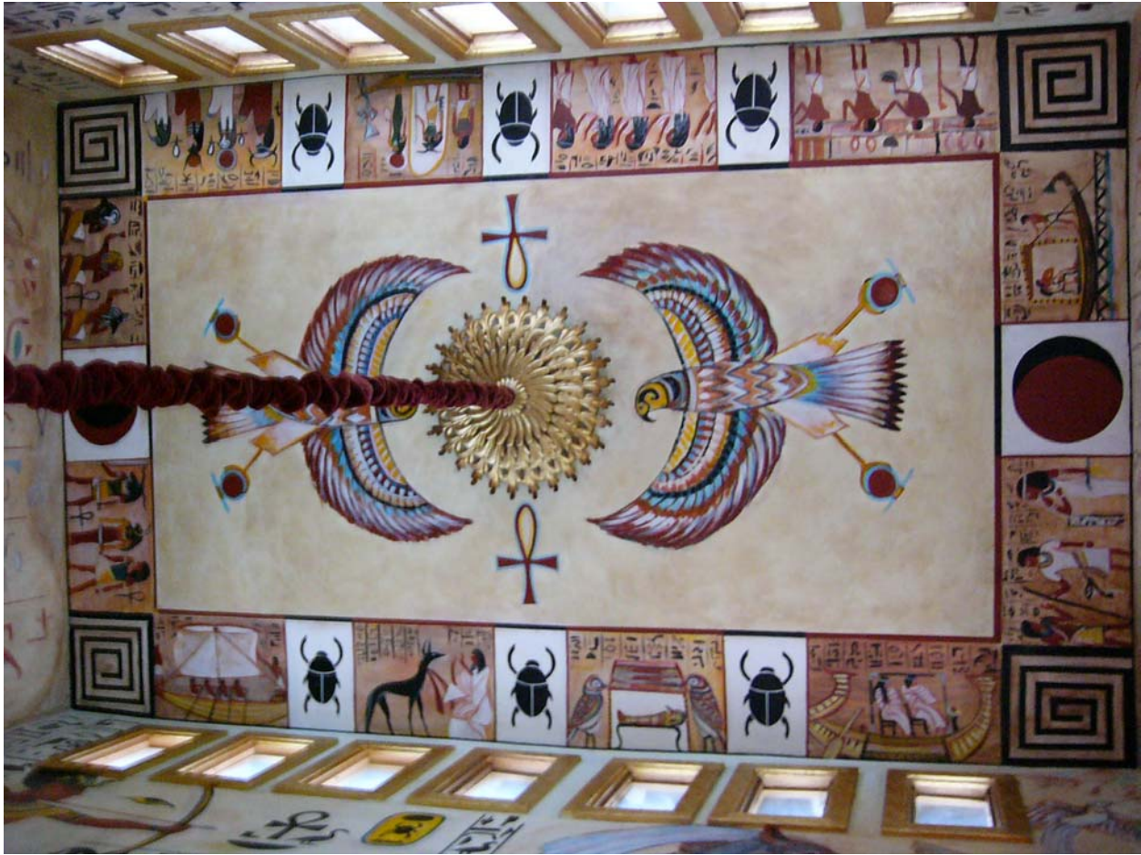
Egyptian Ceiling Private home in New York