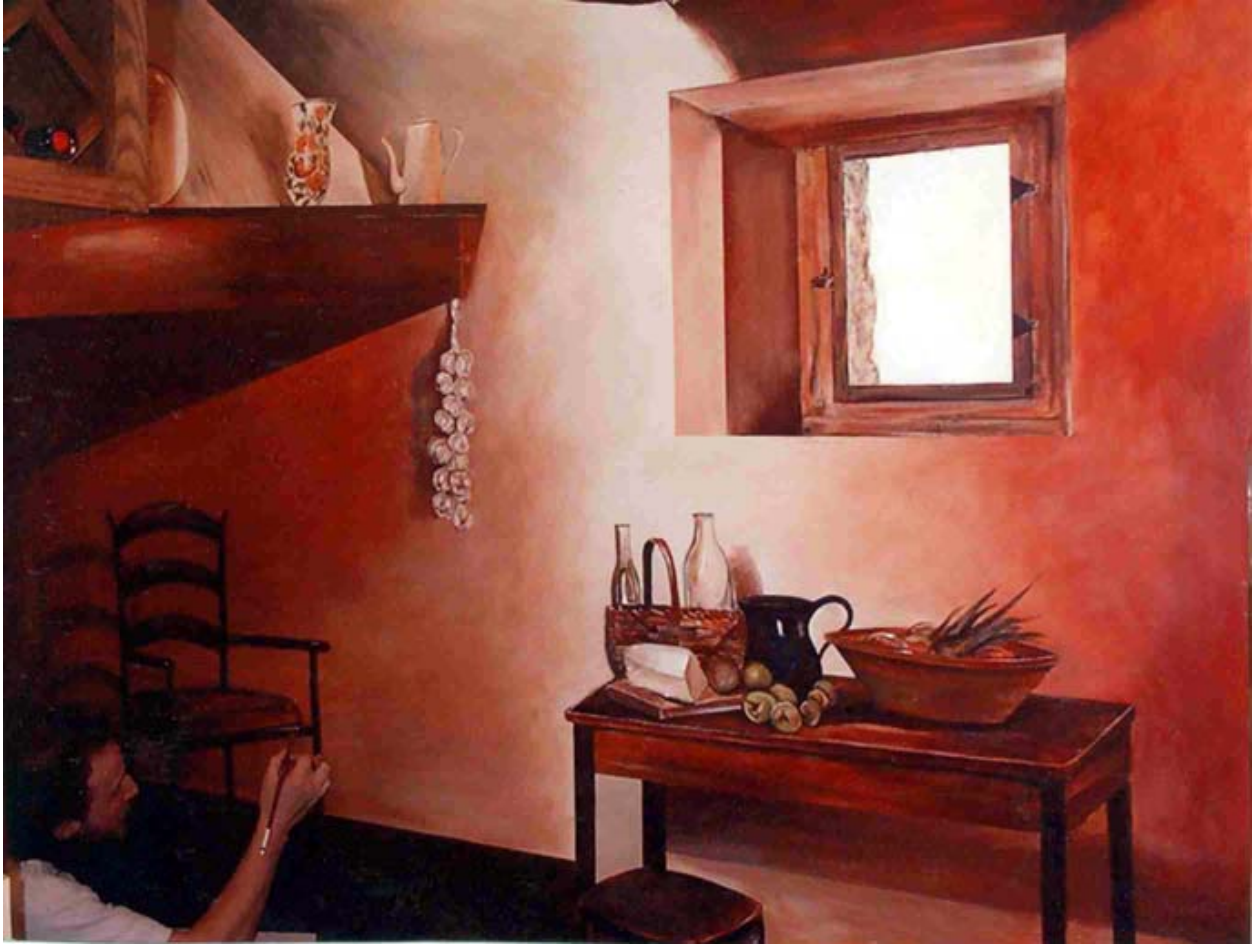
Tuscan Window 2003